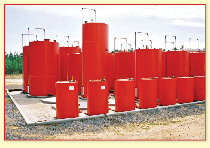
Pee Dee Tank 1333 N. Douglas Street Florence, SC 29501

From square tanks to cylindrical tanks; when you purchase a Pee Dee Tank you are getting over 54 years of manufacturing experience, unmatched customer service, and industry leading delivery times. Our years of experience make a difference in the way we do business and we are proud of our commitment to customer satisfaction.